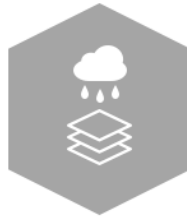
WATHER & SOIL MANGEMENT